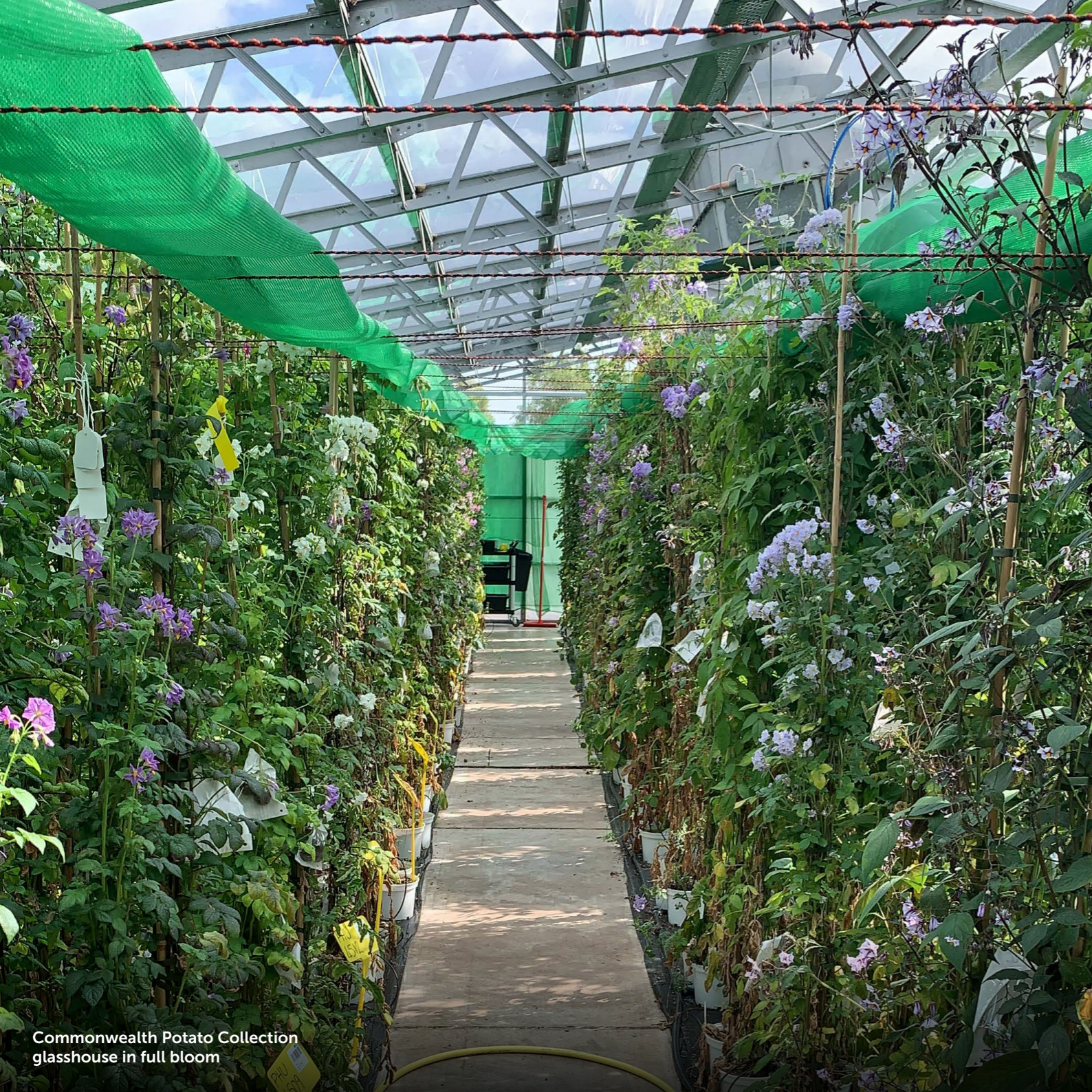
Commonwealth Potato Collection glasshouse in full bloom