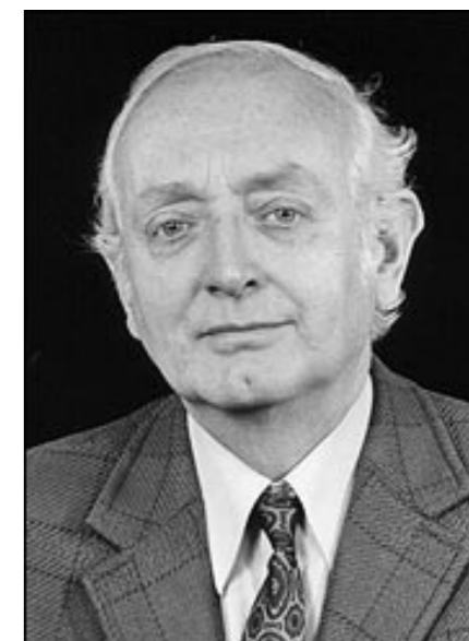
Professor Jack Hawkes

Today, our gene bank serves as an ex-situ reservoir for wild relatives and primitive cultivated types of potato. Researchers world-wide request access to the collection and it is our responsibility to preserve this invaluable material and to support scientific advancements. The natural diversity preserved in the CPC holds the key to future-proof the third most important global food crop against the threats posed by climate change and to foster sustainable crop production. The species and images showcased in this booklet represent a small fraction of the diverse range found within the collection.