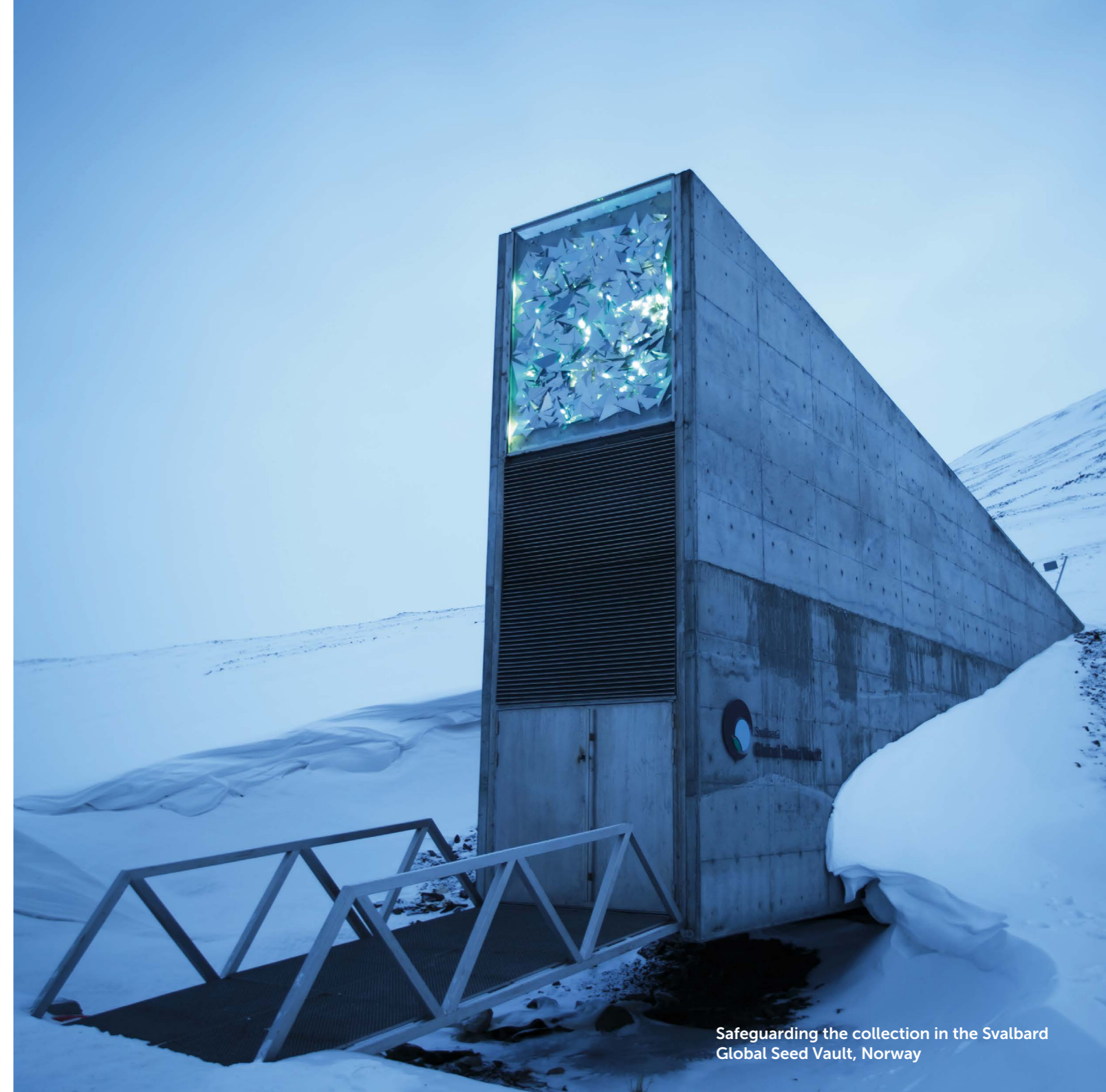
Safeguarding the collection in the Svalbard Global Seed Vault, Norway

As a prominent example, the collection provided the foundation of European cultivars and their resistance to the Potato Cyst Nematode species Globodera rostochiensis . The resistance was identified and mobilised from the accession CPC 1673 ( Solanum tuberosum group Andigena ) and is now found in almost all new potato cultivars and was first deployed in the famous cultivar Maris Piper.